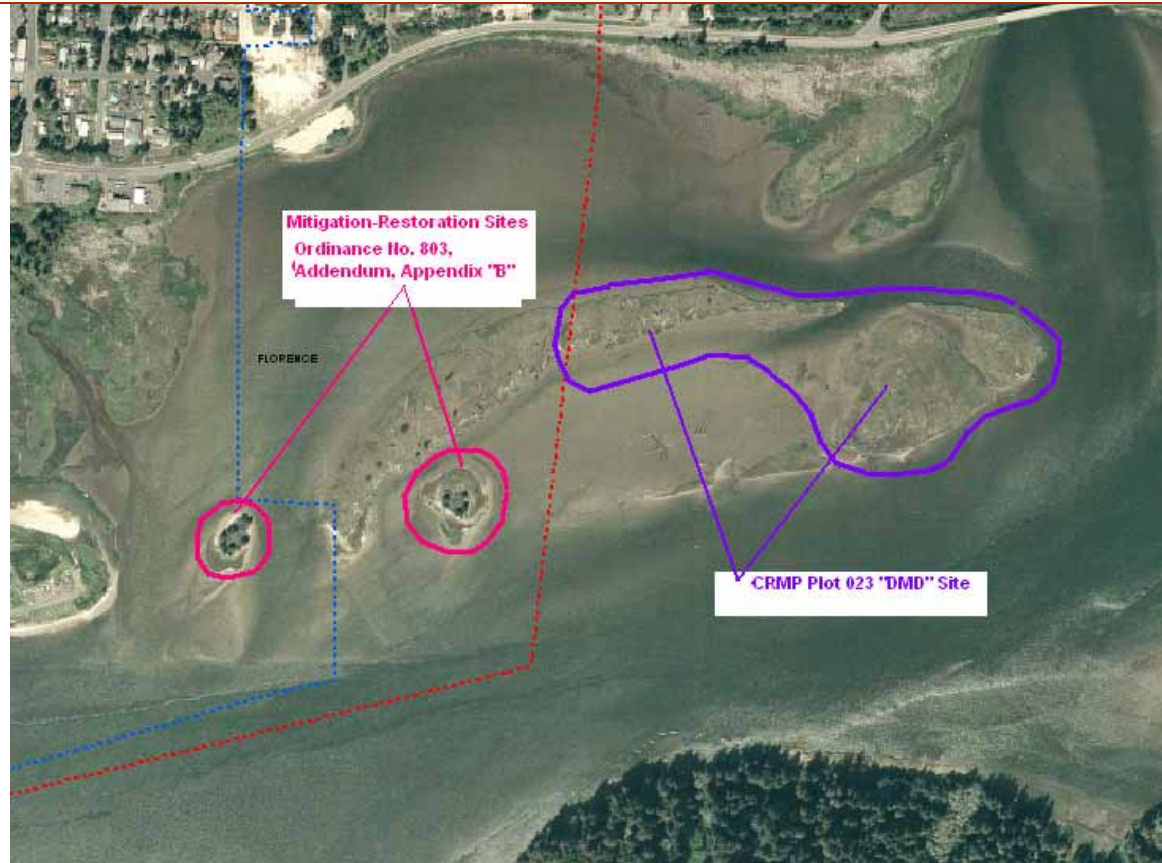
2004 aerial with site boundaries

The Board of County Commissioners identified two mitigation and restoration sites with the adoption of Ordinance No. 803 (June 19, 1980). Ref: Addendum to Coastal Goals Compliance Report , Appendix "B", page 1, "Map 1A". Identified and described the two "islands" as depicted in red boundaries in the left half of the above aerial photograph.